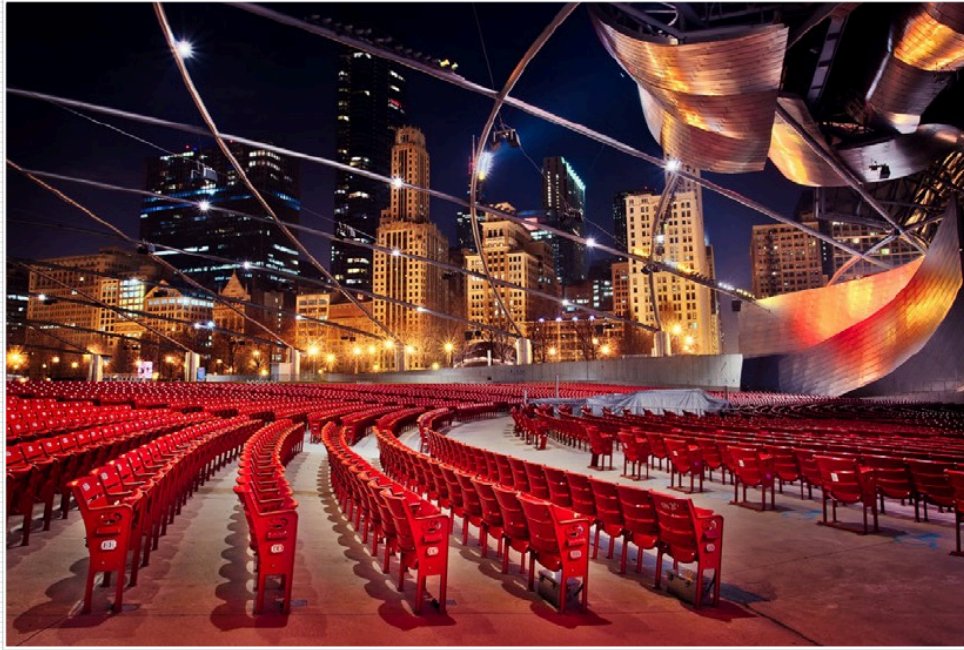
Hobbyists Camera Club