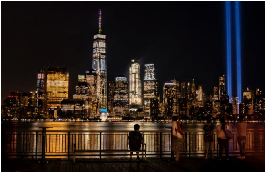
First Place: Tom Heed